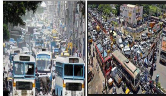
Fig. 1. Traffic in Bangalore city.

Traffic congestion is a major problem in cities of developing Countries like India. Growth in urban population and the middle-class segment contribute significantly to the rising number of vehicles in the cities [6]. Congestion on roads eventually results in slow moving traffic, which increases the time of travel, thus stands-out as one of the major issues in metropolitan cities. In [7], green wave system was discussed, which was used to provide clearance to any emergency vehicle by turning all the red lights to green on the path of the emergency vehicle, hence providing a complete green wave to the desired vehicle. A 'green wave' is the synchronization of the green phase of traffic signals. With a 'green wave' setup, a vehicle passing through a green signal will continue to receive green signals as it travels down the road. In addition to the green wave path, the system will track a stolen vehicle when it passes through a traffic light. Advantage of the system is that GPS inside the vehicle does not require additional power. The biggest disadvantage of green waves is that, when the wave is disturbed, the disturbance can cause traffic problems that can be exacerbated by the synchronization.