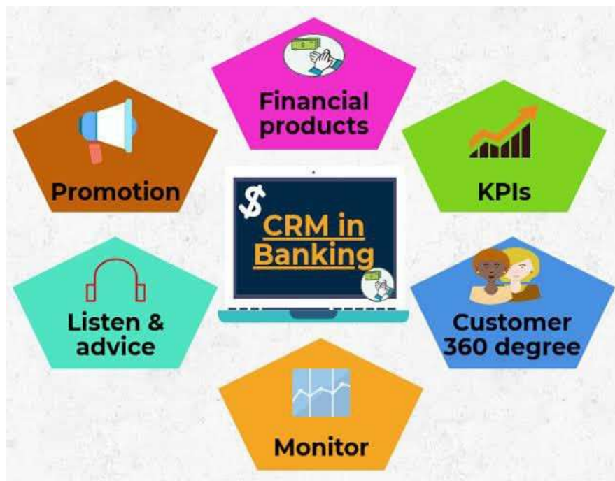
Figure 1 CRM in Banking (Kapture CX, 2014)

From RBV's perspective, it is possible to achieve sustained competitive advantages given that an organization deploys resources that are valuable, rare, inimitable, and non-substitutable. CRM tools fulfil these requirements as they combine data analytical elements with the respective customer relation processes in order to produce substantial information and superior services for banks.