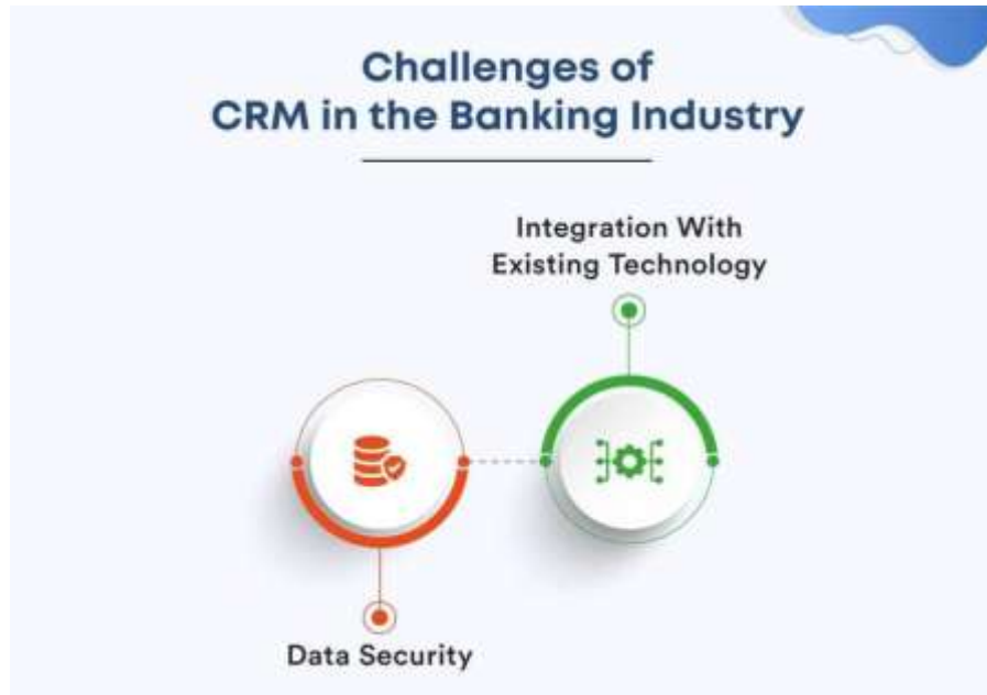
Figure 2 Challenges of CRM in banking (QIT Software, 2014)

Cognitive applications like the AI chatbots which are harmonized with the CRM make communication real-time to produce a response to customer inquiries. Similar to CRM implementation in banking, the 5Cs Framework that incorporates Customer, Cost, Convenience, Communication, and Channel also provide for banking .