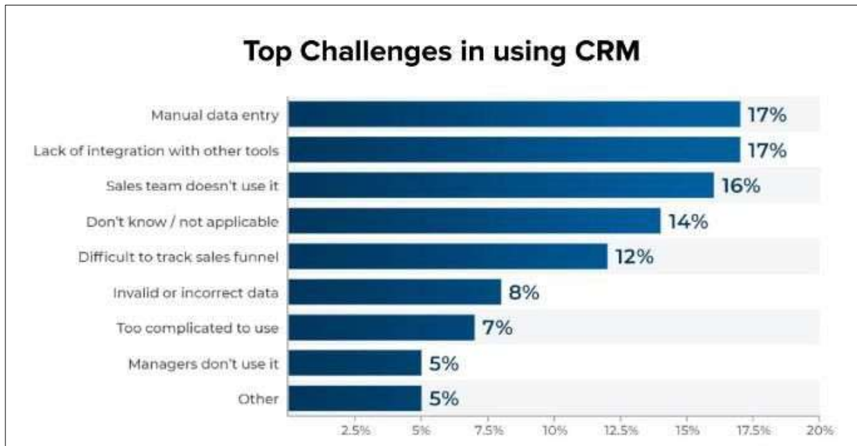
Figure 3 Challenges in CRM (Appinventiv, 2014)