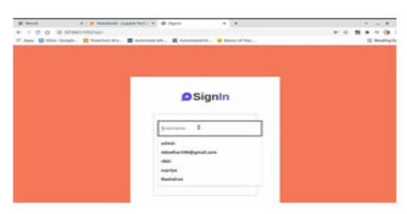
Fig.5: User login