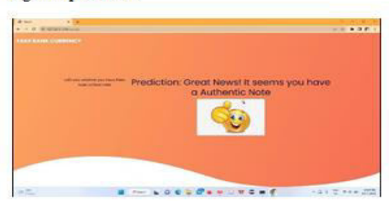
Fig.7: Prediction result