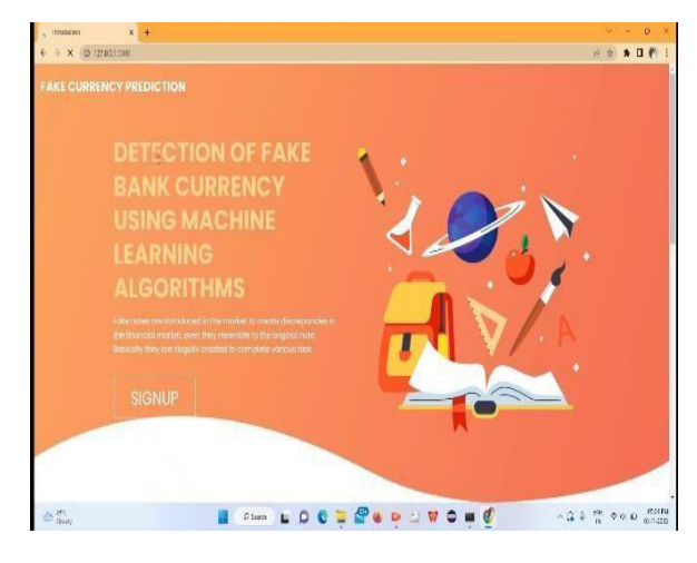
Fig.3: Home screen