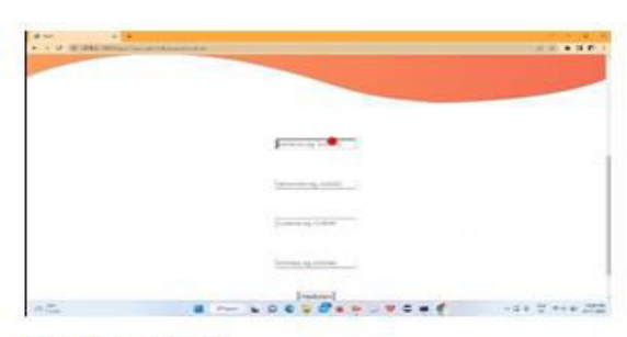
Fig.6: Input screen