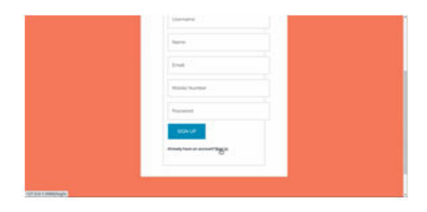
Fig.4: User registration