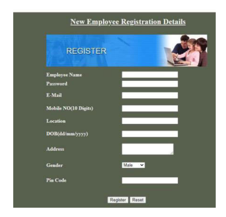
Figure 3:Registration Page