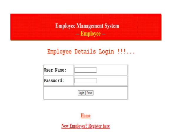
Figure 2: Employee Login page