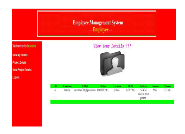
Figure 5: View My Details