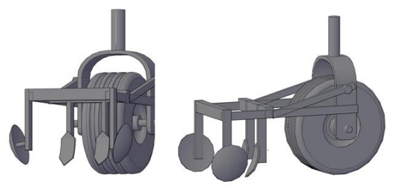
Figures 3. Working device for demolition of transverse floors

With this in mind, new methods of cross-pole laying and demolition are being developed today, one of which is to equip cultivation tractors with additional equipment.