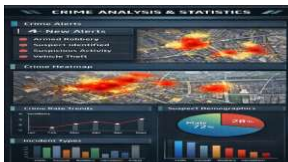
Fig 6.3: Crime Analysis