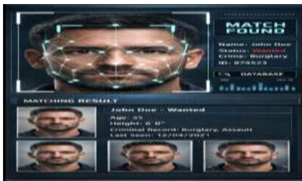
Fig 6.2: Facial Recognition