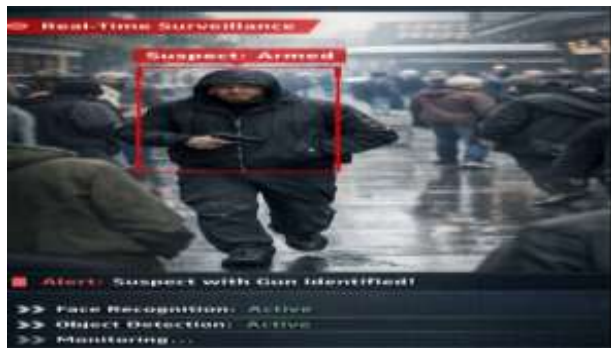
Fig 6.1: Smart Crime Detection