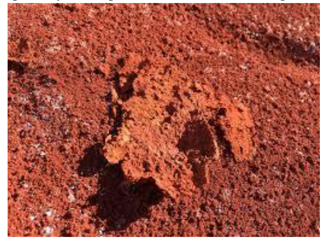
Fig. 2: Red mud.

Red mud is an aluminium industrial waste product which is red in colour. Its characteristics depends on the nature of bauxite ore used in the extraction of aluminium which slightly differ from place to place, out of which 4.5 tons of bauxite 1.0 tons of aluminium is extracted and 2/3rd will be the waste product. This red mud (alumina waste) is used in concrete for partial replacement of cement without sacrificing the quality and the desired strength. As to the resource utilization of red mud, alumina companies have been carrying out many technical researches on production of construction material, especially cement production and glass production, production of filling material for plastic, production of road base. And they have made some progress, especially in the production of cement using red mud.