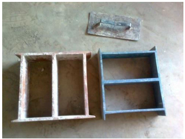
Fig. 5: Concrete bricks moulds.