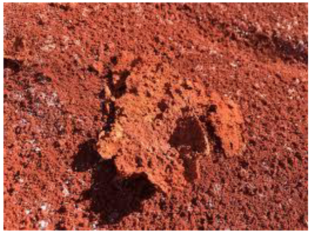
Fig. 3: Red mud. Table. 4: Physical properties of red mud.

A solid- waste generated at the Aluminium plants all over the world. In Western countries; about 35 million tons of red mud is produced yearly. Because of the complex physicochemical properties of red mud it is very challenging task for the designers to find out the economical utilization and safe disposal of red mud. Disposal of this waste was the first major problem encountered by the alumina industry after the adoption of the Bayer process.