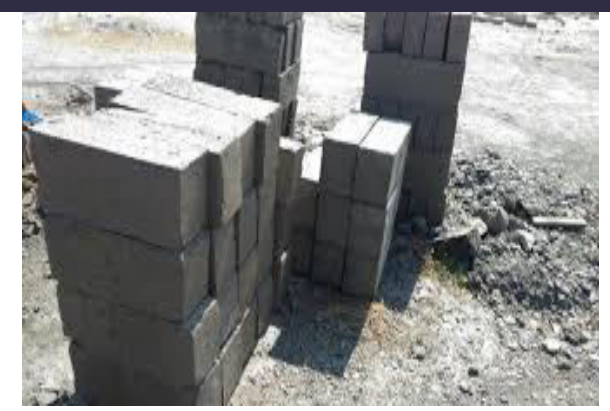
Fig. 7: Brick samples.