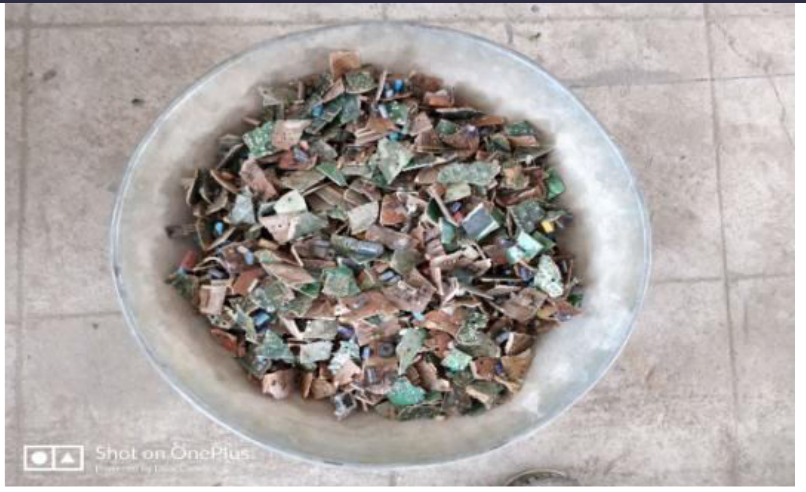
Fig. 1: E waste.