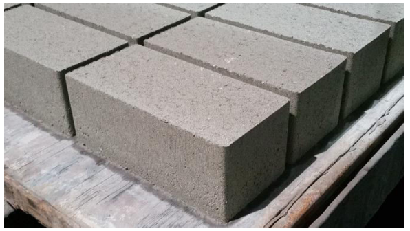
Fig. 6: Sprinkling water curing of bricks.