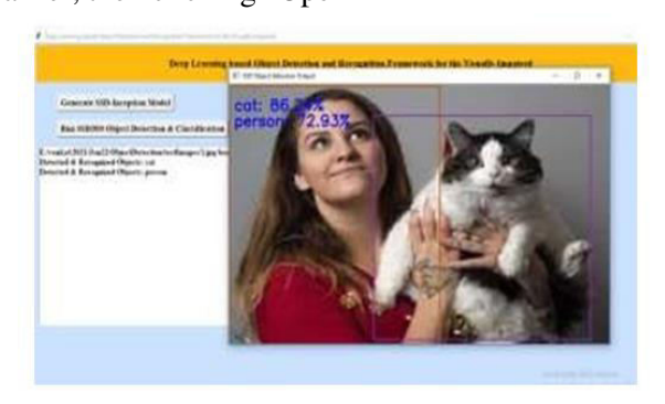
Fig.4. Try different photos after items in the image to the right screen