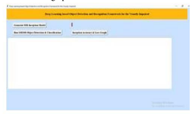
Fig.1.To load designs and get to the lower screen, simply click the Create SSD-Inception Model button