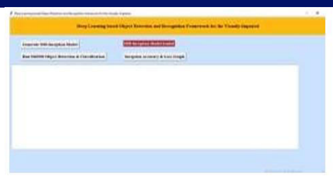
Fig.2 Modelling are loaded in the panel ahead in red text; click "Run SSD300 Object Detection & Classification"