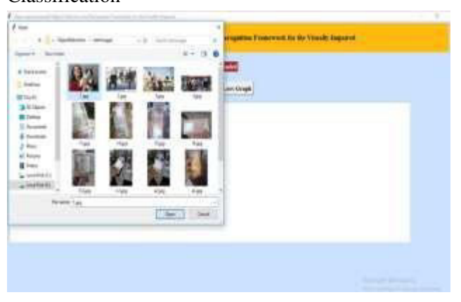
Fig.3. Choosing and adding a 1.jpg file to the screen earlier, then clicking "Open"