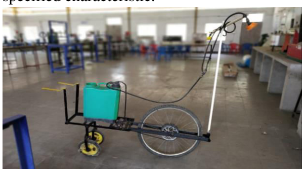
Fig 3.1 Wheel based automatic liquid sprayer

In suction stroke, the low weight is made within the siphon chamber this is beneath the climatic weight (760 mm of Hg) due to that low weight the fluid is suck into the siphon chamber through fomenter, in which the liquids are combined homogeneously as indicated with the resource of the proportion 1:1.In stress stroke the immoderate weight is made and channel valve closes clearly because of such excessive weight the hole valve is opened, because of mechanical electricity (functionality, kinematic and strength) evaluation the liquid is moved from siphon outlet to the desired motive thru fluctuates middle of the street associations, through making use of sprinklers the water will splash drop astute so spreading of the fluid will arrive at the specified characteristic.