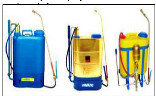
Fig. 2.2: knapsack sprayers