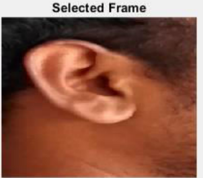
Fig.3.2. Represents the number of frames and selected from user defined.

A daubechies wavelet filter transform for feature grabbing without of any illusion effects, lightening effects as well as occlusions are carried out by some distance metrics. which is shown below with approximation and details parts like horizontal, vertical and diagonal of the image from low pass filter.