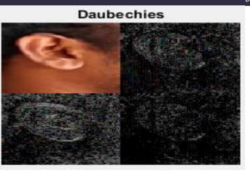
Fig.3.3. Application of daubechies wavelet transform to the image.

A daubechies wavelet filter transform for feature grabbing without of any illusion effects, lightening effects as well as occlusions are carried out by some distance metrics. which is shown below with approximation and details parts like horizontal, vertical and diagonal of the image from low pass filter.