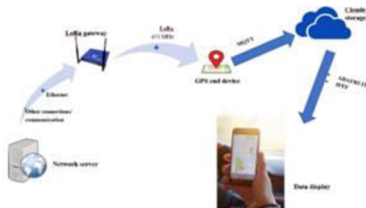
Fig 4: Work Flow Proposed Method.

cloud with help MQTT protocol. Lora technology is the help to provide the internet to the Arduino. In this process, Lora gateway will help the process. If the vehicle will cross the ( r \geq 5 ) 5 K.M radius owner will get the notification and location of the vehicle. it is just like an alert message. If the animal cross the ( r \geq 10 ) 10 K.M mobile get the red alert notification. If the speed of the vehicle is >50 KMPH owner will get the notification. The way of the vehicle will be updated into the cloud. For checking to update and tracking the vehicle location specially develop the one android application. With help of the IFTTT and ad fruit smart mobile is connected to thecloud.