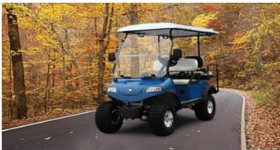
Fig 1: Vehicle tracking in remote areas

were not in the signal range then they can automatically switch to out personal device system by switching on to the system which we invented now can help in the situation in the problematic situations to over come from that type of stuck up situation's. here we use the wireless connection protocol to avoid facing the problem with network and connecting to the server and help the user to track your location's and get the help immediately is working or inventing purpose of trios idea.