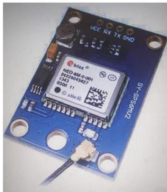
Fig 3: NEO-6m node.

Neo6m module connected with the antenna is used for the signal processing system. Node mcu can be connected to the system and the power supply is provided to it for the processing of the signal establishment. Now Lora sender is connected with node mcu. This connection setup is placed within the vehicle.