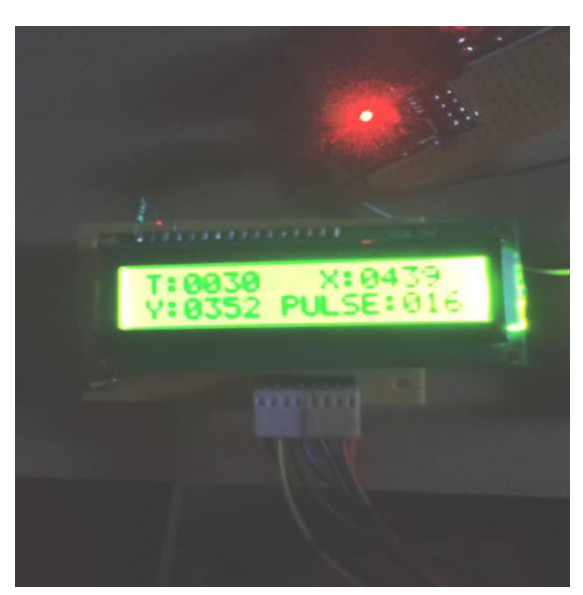
Fig3: Output Values 6.CONCLUSIONS AND FUTURE WORK

In this paper, an enhanced fall detection system based on Wearable device was proposed and implemented successfully detected accidental falls in a consumer home application. By using information from an accelerometer, smart sensor and cardio tachometer, the impacts of falls can successfully be distinguished. Wearable device is completely safe because it is worn on the outside of the body not inside the body. This work is of low cost, very effective, and productive.