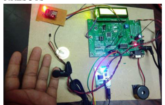
Fig2: Hardware Implementation