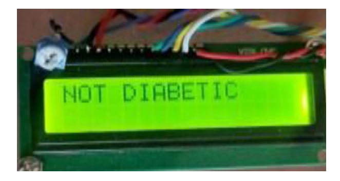
Fig. 4: Result displayed as not diabetic.