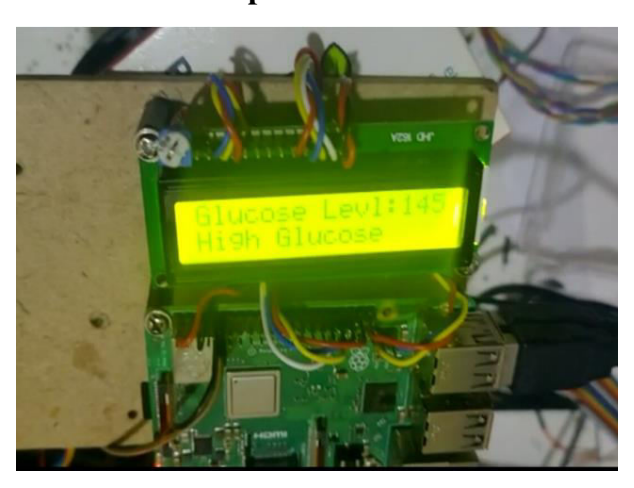
Fig. 3: Result displayed on LCD display.