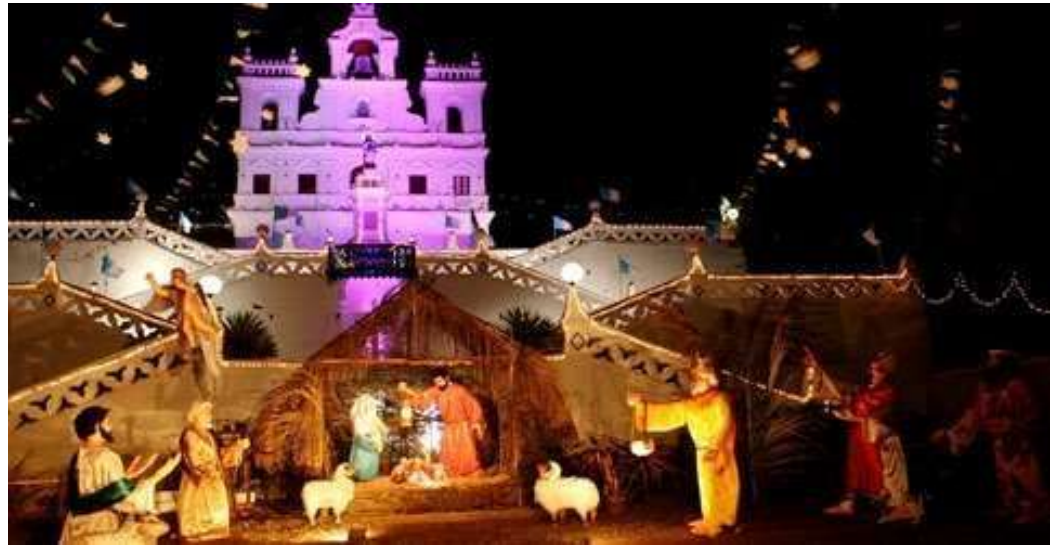
Figure 3 Festive Season of Christmas

When Goa first opened as a tourist destination, it catered primarily to Indians and other land travelers. However, as air travel became more common, and economical (no frills) flights became more accessible, a new phenomenon: international tourism, with visitors from countries with higher incomes seeking out those with lower costs and higher standards of living, was born and is now booming. Due to the high disposable income clients' demand for increasingly sophisticated options for their fulfilments, mass tourism has become increasingly exploitative (Equations, 2008). Even though modern tourists don't come to Goa to do business, the "fair" still goes on, with activities and sights to please anybody interested in sports, culture, religion, food, fun, fitness, or rest and relaxation (DOT, 2015).