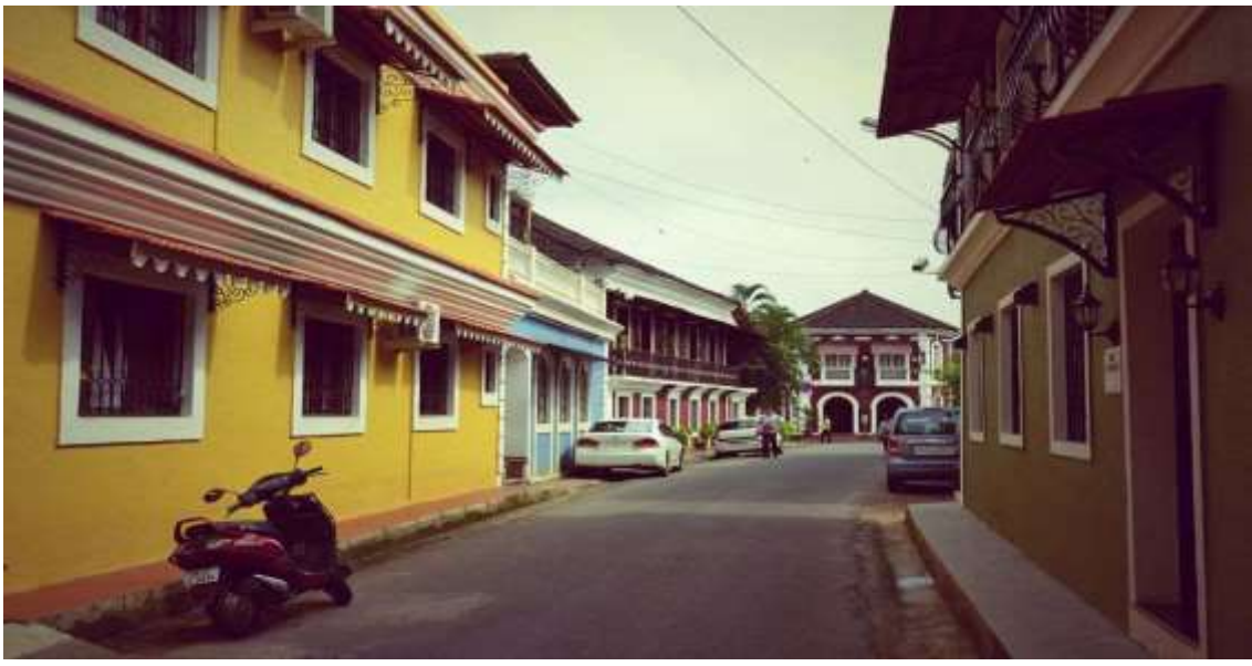
Figure 4 Portuguese Architecture- Heritage

Goa's love of music, art, history, and culture is a clear indication of the region's rich "Indo-Portuguese" cultural legacy. Tourists from all over the world go to Goa for its "Sun, sand, and Sea" (Sawant, 2013) and a chance to experience the state's renowned beaches and unique architecture. Goa, like many other popular tourist destinations, has seen an upsurge in visitors from all over the world as a result of the boom in globalized tourism. Visitors attend "International Film Festivals India (IFFI), traditional festivals like St. Francis Xavier Feast, Three Kings Feast, Christmas, Shigmo Ustav, Carnival," among others, to learn about and celebrate India's rich cultural heritage. They visit the casinos in big numbers, especially the offshore casinos, and they take part in beach tourism and ecotourism, particularly catering to those who want to take in the area's stunning scenery, enjoy some time in the great outdoors, and learn about the area's unique culture.