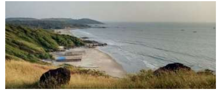
Figure 1 Virgin Beaches of Goa

Goa's tourism business increased steadily throughout the years, necessitating the establishment of a system to maintain public safety. The 'O Centro do Informacao e Tourismo de Goa' was founded in 1959 and is considered one of the earliest authority in this field. The Department for Information, Publicity, and Tourism was established in 1962, not long after Liberation on December 19th, 1961; however, the importance of the tourism industry was not fully appreciated until much later; the Department of Tourism was not established until 1977, and the Goa, Daman, and Dui Registration of Tourism and Trade Act was not passed by the Legislative Assembly until 1982. Domestic and foreign tourists began flocking to Goa shortly after Liberation.