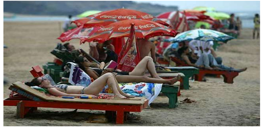
Figure 5 Sun bathing on the Beaches in the Modern Times

experience, north Goa is home to a vast network of hotels, resorts, restaurants, bars, discotheques, casinos, tattoo studios, stores, and enterprises. Tourists get the rare opportunity to rest and soak up some rays right next to the water.