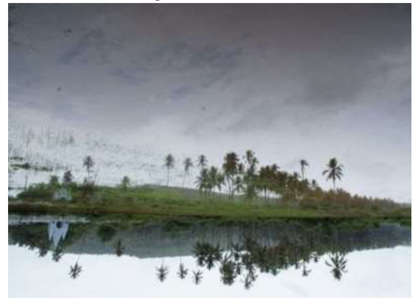
Figure 1 Monsoons in Goa

This chapter covers topics such as Goan background, infrastructure growth, tourism's beginnings and significance, ecotourism's challenges, the government's role in fostering tourism for the state's long-term economic health, and the role of experiential activities in Goa's promotion of sustainable development.