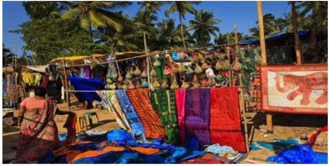
Figure 6 Commercialization of Tourism

Tourists can always find something to eat or drink at one of the many huts that have sprung up along the coast. There are times when this is combined with inexpensive ayurvedic treatments performed on the beachfront bunks. Artists from India travel from beach to beach selling their items and providing services like hair braiding and mehendi designs so that tourists can get a taste of India.