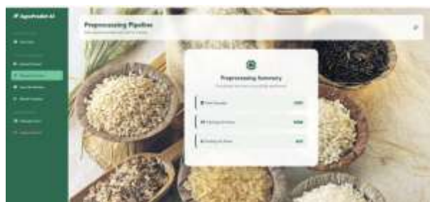
Fig 6.2: Data Preprocessing