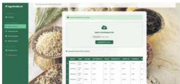
Fig 6.1: Upload Dataset