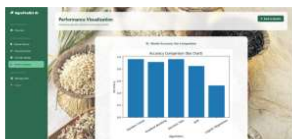
Fig 6.4: Performance Visualization