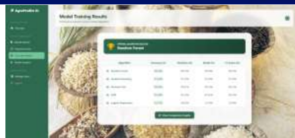
Fig 6.3: Model Training Results