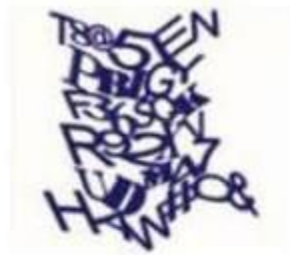
Fig. 2. A ClickText image with 33 characters.

different views, textures, colors, lightning effects, and optionally distortions. The resulting 2D animals are then arranged on a cluttered background such as grassland. Some