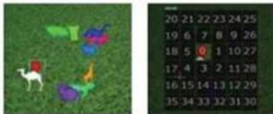
Fig.4. A Click Animal image (left) and 6 \times 6 grid (right) determined by red turkey's bounding rectangle.

animals may be occluded by other animals in the image, but their core parts are not