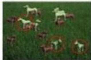
Fig. 3. Captcha Zoo with horses circled red.