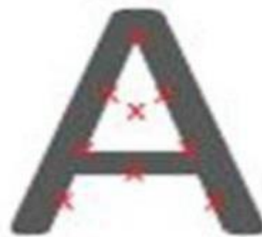
Fig.5. some invariant points (red crosses) of "A". Clickable points in TextPoints are salient points of their characters and thus help remember a password, but cannot be

Authentication: When creating a password, all clickable points are marked on corresponding characters in aCaRP image for a user to select. During authentication, the user first identifies her chosen characters, and clicks the password points on the right characters. The authentication server maps each user-clicked point on the image to find the closest clickable point. If their distance exceeds a tolerable range, login fails. Otherwise a sequence of clickable points is recovered, and its hash value is computed to compare with the stored value