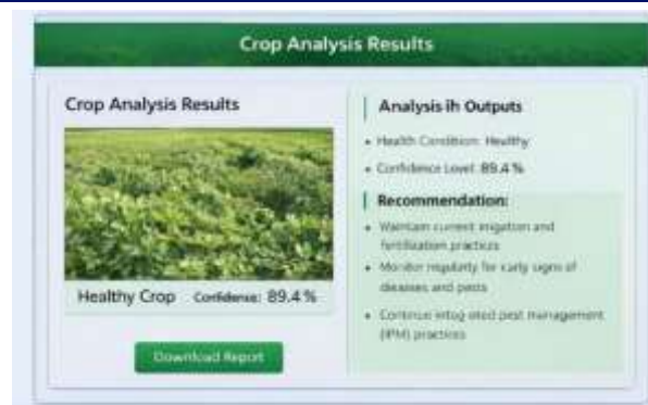
Fig 6.4: Crop Analysis Result