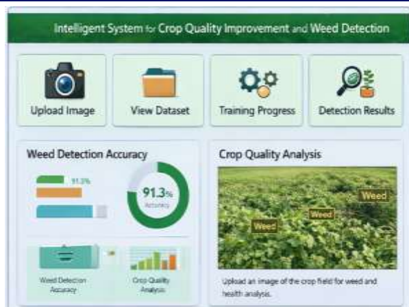
Fig 6.1: Home Page