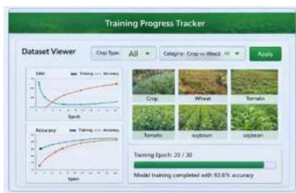
Fig 6.3: Training Models