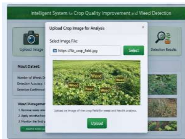
Fig 6.2: Dataset Upload