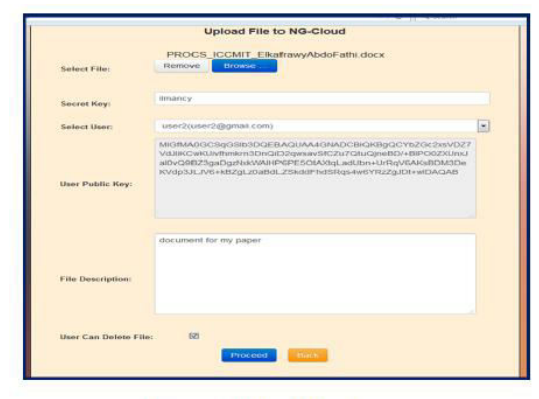
Fig. 5. example of file upload

8. Then, clicking the button "Proceed" to end the process of file uploading.