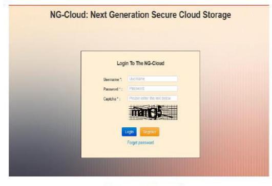
(a) Login in the system