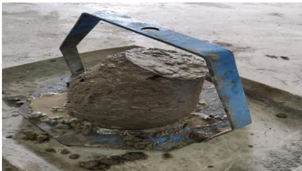
Figure 5: Slump Cone Test

found to be 65mm. In this research study mix design was calculated for slump value of 50-75 mm. So, the required slump was achieved for nominal concrete under normal conditions without use of any mineral or chemical admixture. Apparatus for Slump cone is shown in Figure 5.