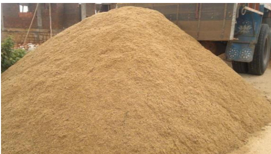
Figure 2: Fine Aggregate