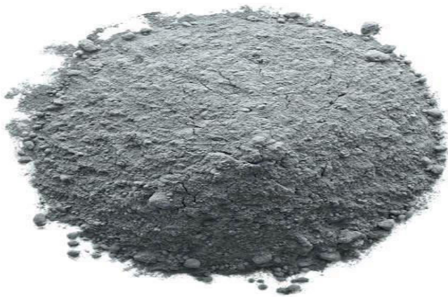
Figure 4: Fly Ash

Fly ash used in this research study is purchased from NTPC dadri and its properties will be checked before using in design mix, Thermocol beads were purchased ansal plaza greater Noida and pumice stone is purchased from N.M Enterprises banglore.