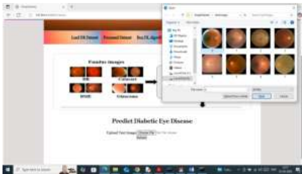
Fig 6.4: Uploading images