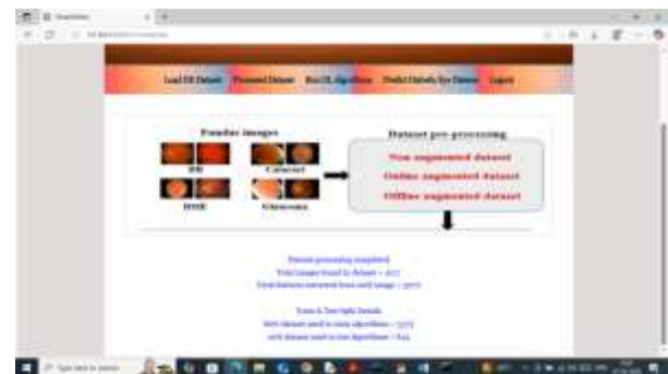
Fig 6.2: Data Preprocessing