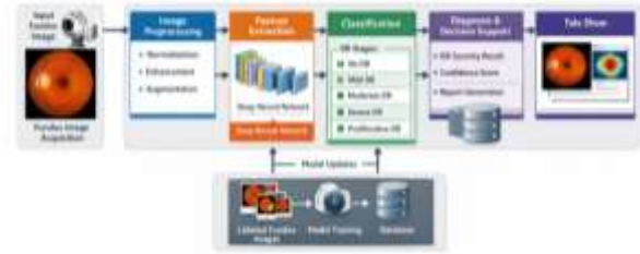
Fig 5.1: Structure of the Proposed System