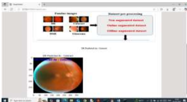
Fig 6.5: Prediction Of Image