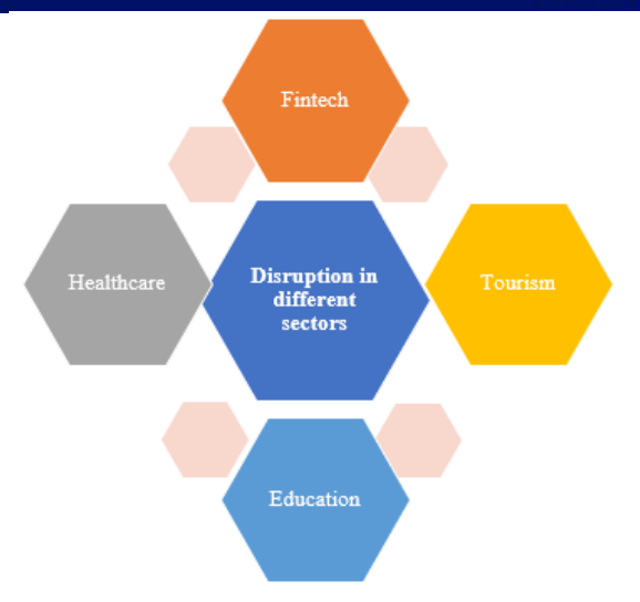
Figure 2: Disruption in different sectors

Digital disruption has its advantages and the same time, a threat for many businesses and industry survival. The new start-ups are investigating ways to reinvent the commercial activities to contend with and extricate bindings. Some rampant breakthroughs in technological disruption are swiggy, Netflix, Byju, Urban Company, and Ola. This disruption is progressively influencing various sectors and it is illustrated in Figure 2. This section discusses the disruption breakthroughs in many sectors.