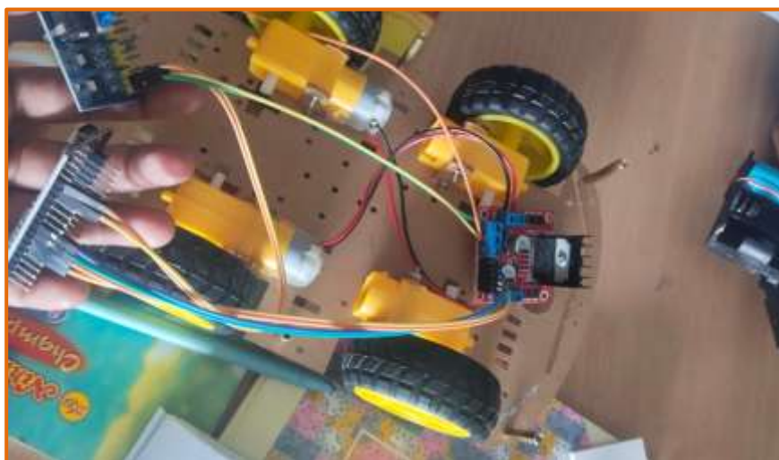
Figure 2: Experimental Setup