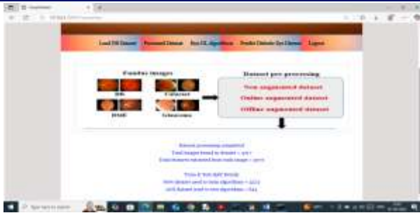
Fig 6.5: Data Preprocessing