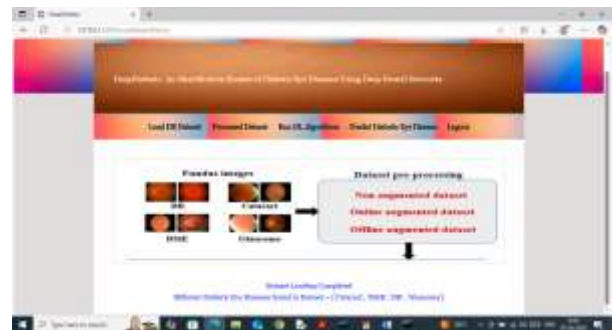
Fig 6.4: Dataset Loading