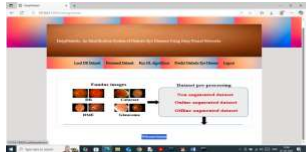
Fig 6.3: User Dashboard Page