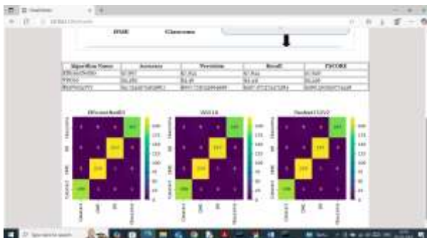
Fig 6.6: Model Training