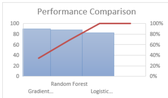
Fig:1.1 performance comparison of different Models