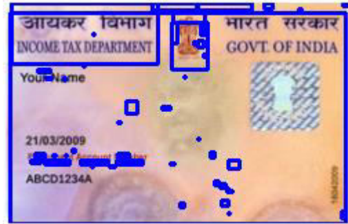
Fig6: Tampered Image