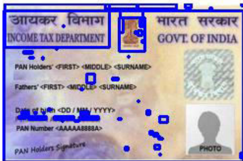
Fig5 Original Image