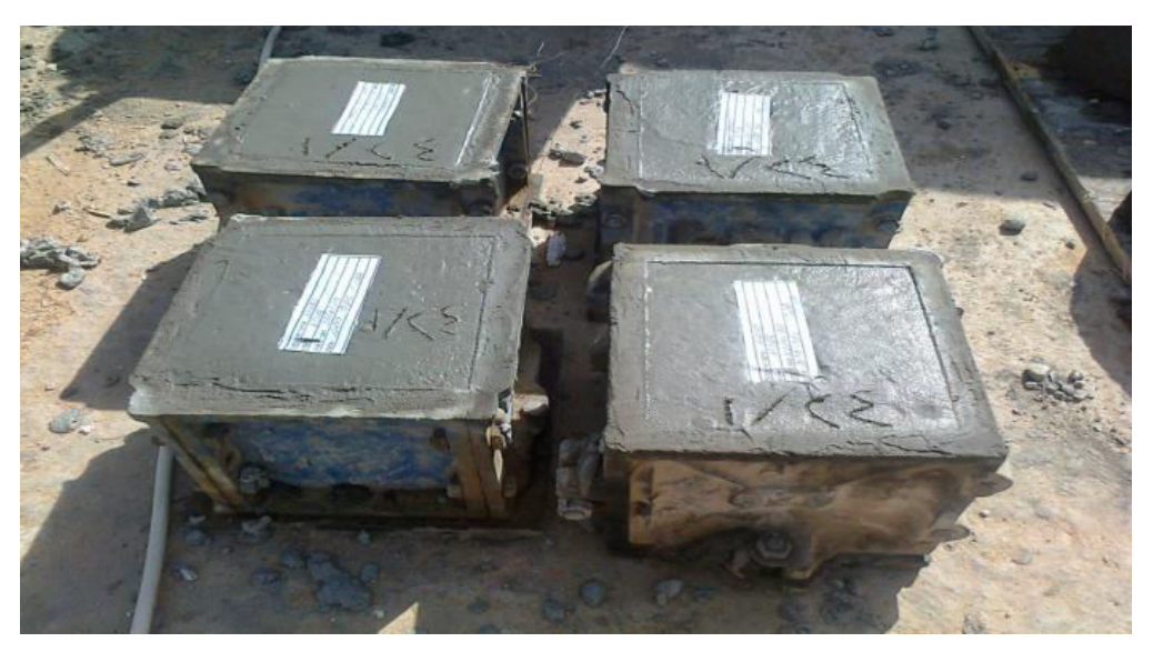
Fig. 1: concrete placed in cube moulds.

Placing and Compaction : Placing the concrete in cube, beam moulds and compaction by manual. Delay in placing and compaction causes evaporation of water which should be avoided. Concrete was cast in pre-oiled cast cube iron moulds in 3 layers by tamping each layer with greater then 35 blows. Then the tamped moulds were placed on the vibrator for compaction and surface finished neat.