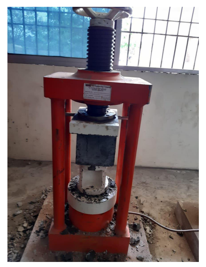
Fig. 2: Compressive strength testing machine.

These specimens are tested by compression testing machine after 7, 14, 28 days curing curing. Load should be applied gradually at the rate of 140 kg/cm2 per minute till the specimens fails. Load at the failure divided by area of specimen gives the compressive strength of concrete.