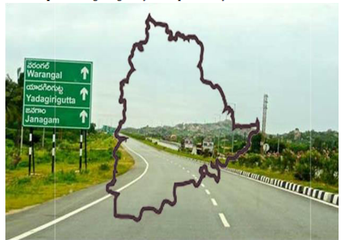
Figure: NH164 Warangal

The prerequisite for catching information on street movement conditions has been around for a long time. The data is required by both, nearby and national government bodies, their advisors, property designers and open enquiries among others. The necessity to catch the data from the street side has prompt the formation of a foundation of expert movement study organizations who can gather the information from the roadside