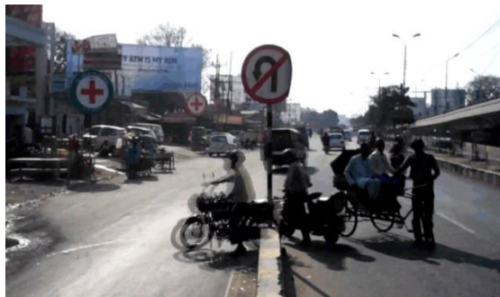
Figure: NH 164 High way U- turn system