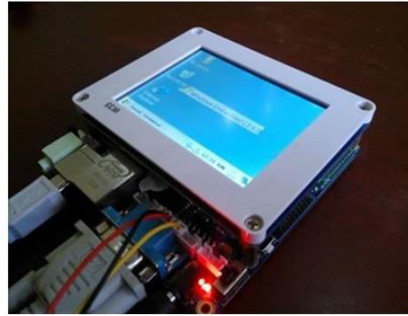
Fig.3. Mini 2440