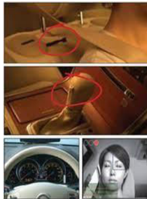
Fig.1: Alcohol sensors

In the implementation of our prototype system, the alcohol sensor (MQ3)is used. MQ-3 gas sensor has high sensitivity to Alcohol, and has good resistance to disturb of gasoline, smoke and vapor. The sensor could be used to detect alcohol with different concentration. It is with low cost and suitable for different application. Also it has Long life and low cost and simple drive circuit.